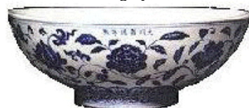
Ming dice bowl (1426 - 1435) valued at £80,00 to £100,000

Chinese dice games (like Cockfighting , Grasping Eight , Strung Flowers , Heaven and Nine , Pursuing Sheep and Sic-Bo ) are often traditionally played with a flat-bottomed porcelain bowl to throw the dice into. Highly decorative antique dice bowls from the Ming and other dynasties often fetch high prices at auction.