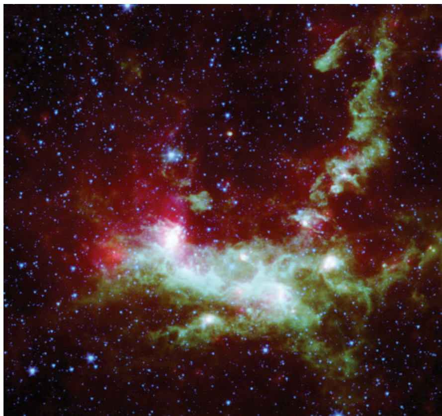
The ancestral home? We are made up of atoms that were created inside distant stars.